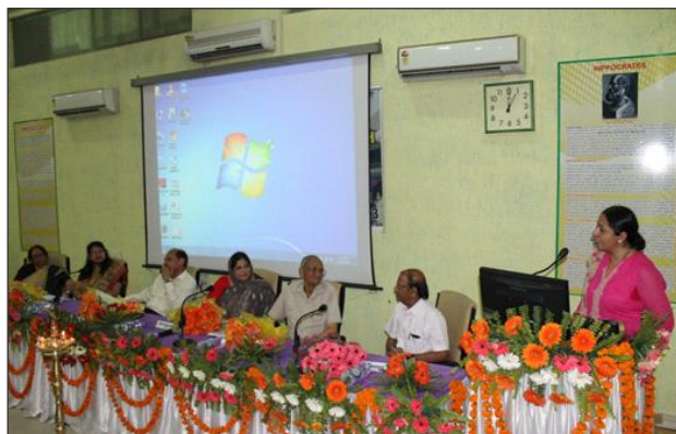
WORKSHOP ON ETHICS IN MEDICAL RESEARCH HELD ON 16 th APRIL 2015